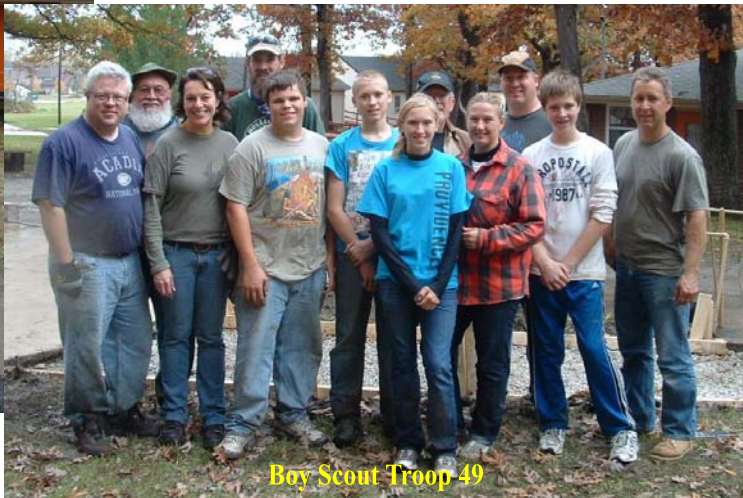
Boy Scout Troop 49