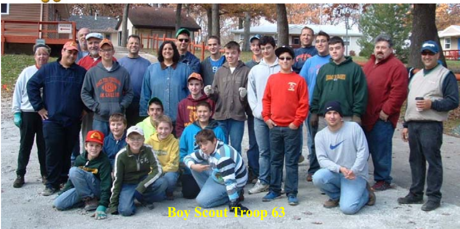
Boy Scout Troop 63