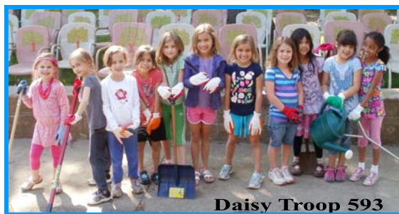
Daisy Troop 593

On May 19 th we had our camp clean up day. Despite the hot weather, we had over 50 people show up to help with various cleaning, repair and maintenance work. We got a lot done thanks to family and friends! We even made friends with some new neighbors. The following day, May 20 th , the St. John's Youth Group helped finish last minute planting & cleaning. It was a great way to end a VERY productive weekend.