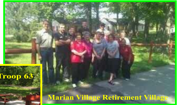
Marian Village Retirement Village