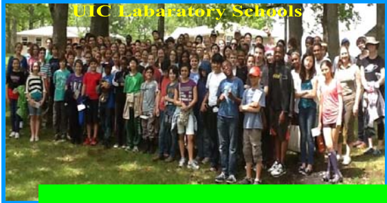
UIC Laboratory Schools