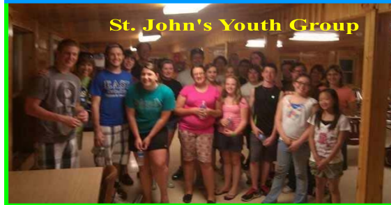
St. John's Youth Group